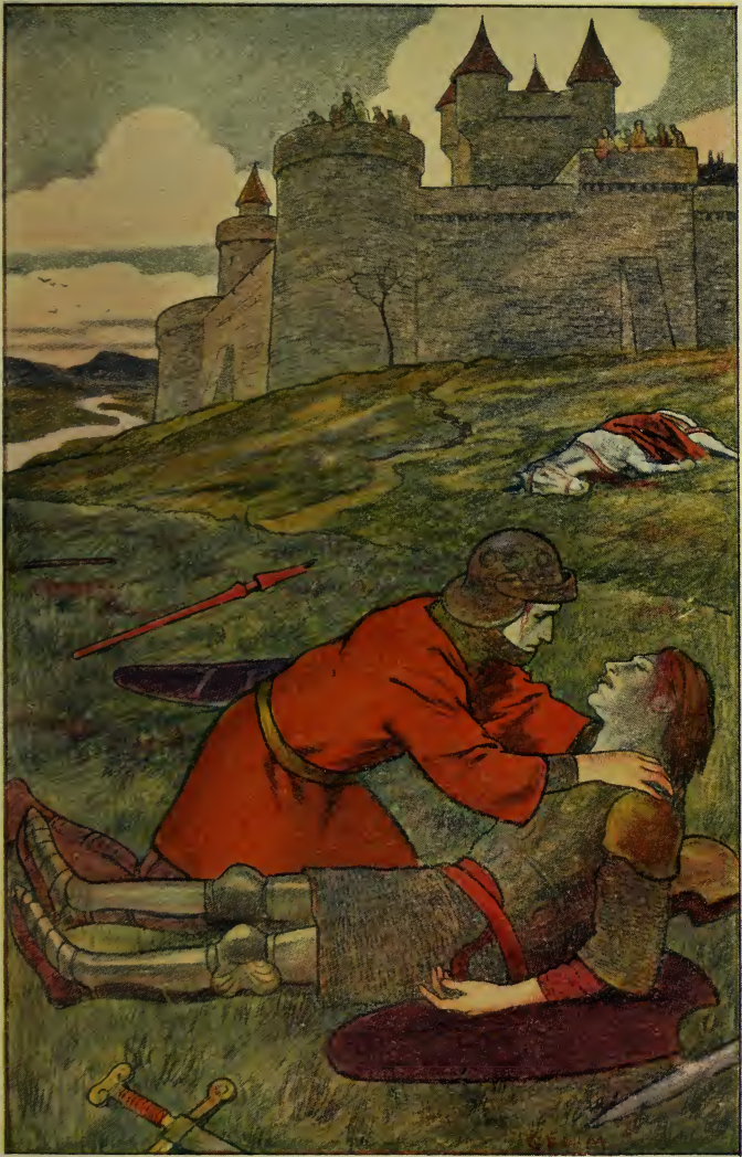
SIR BALIN AND SIR BALAN.